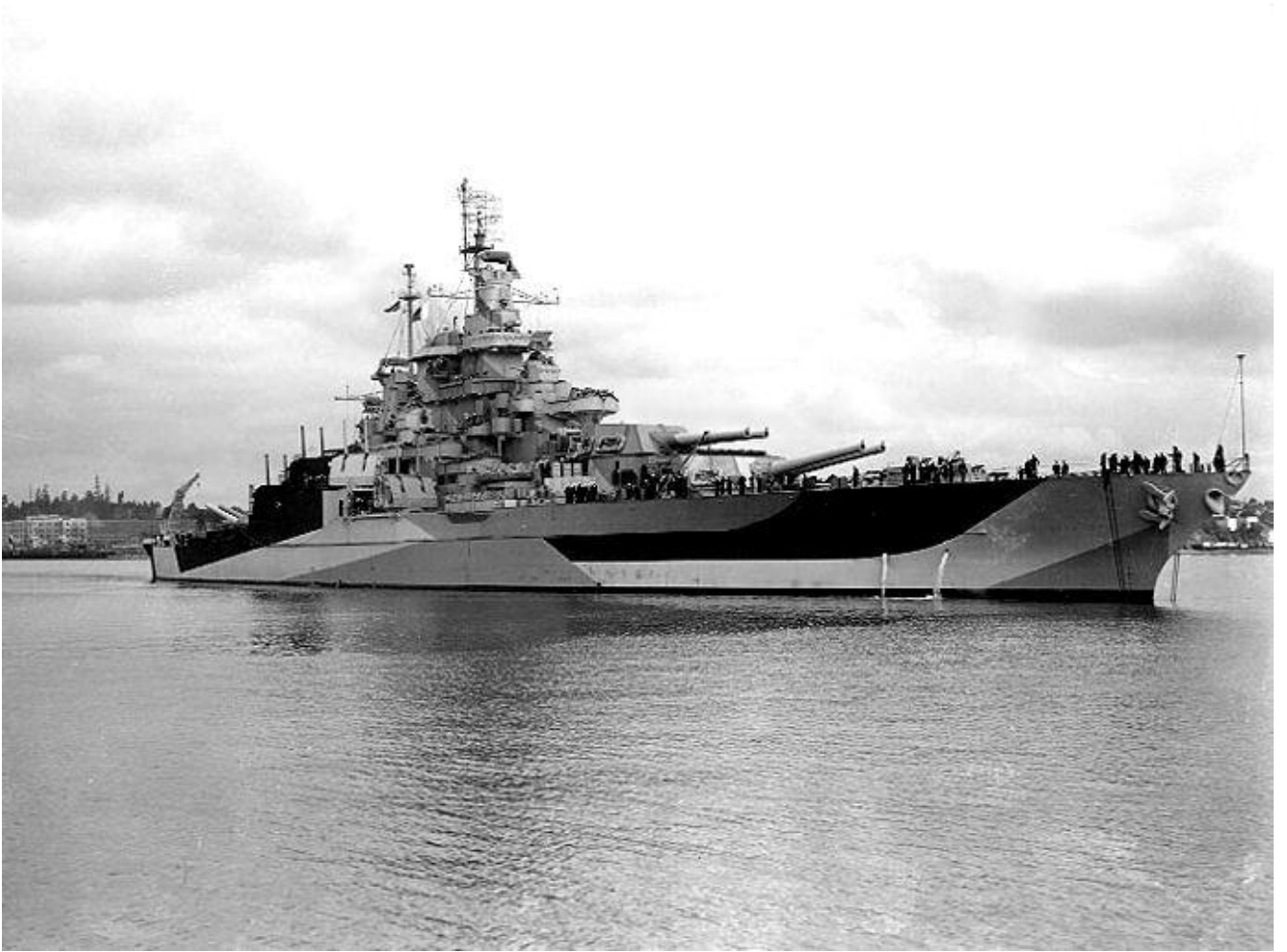
BB 48 USS WEST VIRGINIA