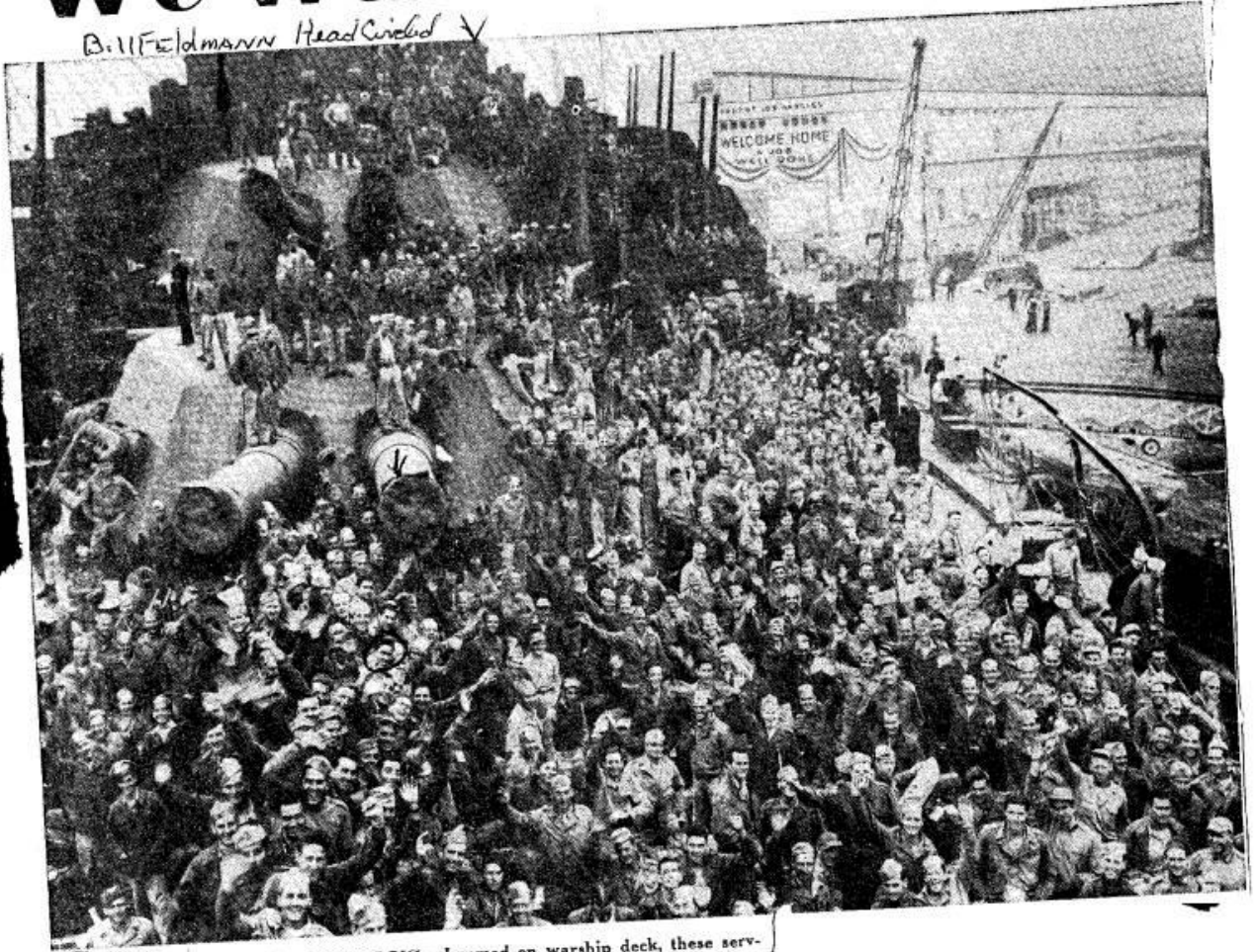
ANXIOUS —Jammed on warship deck, these service men voice their anxiety to head homeward. Hope that all these men would be off

In a few days, they were allowed off the ship, taken by trucks to a nearby military base, processed, and put aboard trains for home.